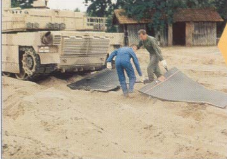
Two Recovery Air Lifting Bags 2000 x 1800 mm are easily slid under the armoured vehicle.