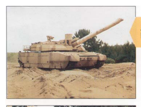
Armoured vehicle trapped in sand. Hull in contact with sand.