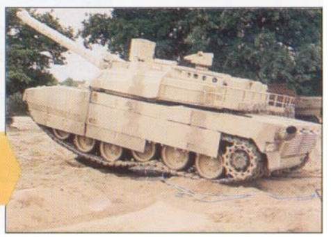
Armoured vehicle ready to leave the area.